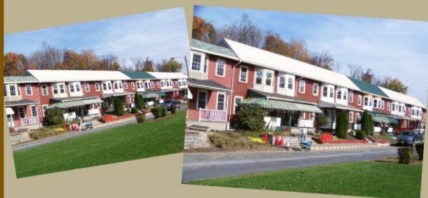
Juniata Terrace Construction October 28, 2014