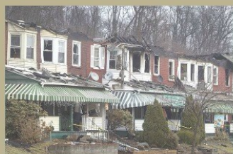
Juniata Terrace Fire March 27, 2014

At the end of March, the Juniata Terrace Borough and its residents suffered through a devastating fire that severely damaged and affected a number of homes in the 300 block of Terrace Boulevard. Since that time, a local developer has purchased the burnt out structures and is currently renovating the homes. Construction is similar to existing structures.