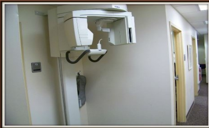
Mifflin - Juniata Dental Clinic