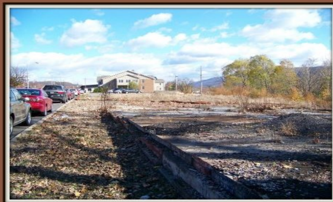
Mann Edge Terrace Phase II