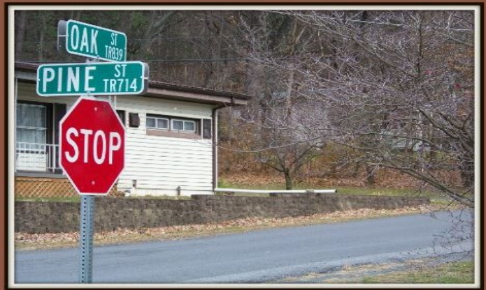
Armagh Township - Oak Street